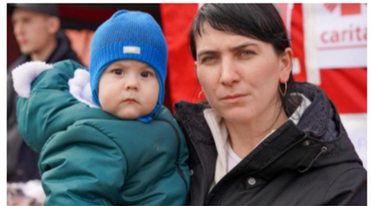
As Ukrainians flee their homes die to the conflict with Russia. CRS partner Caritas Poland assists Ukrainians crossing into Poland for safety.

Catholic Relief Services is well known for its presence to disaster areas for bringing immediate aid to those who are in need. Donations may be sent to Catholic Relief Services/Humanitarian Aid for Ukraine. Please send checks to 228 W. Lexington Street, Baltimore, MD 21201-3443 or donations can be directly made through the Catholic Relief Services website at https://www.crs.org/