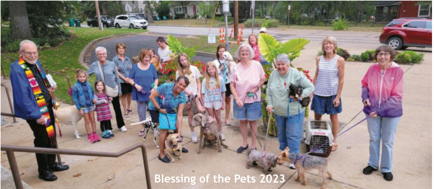
Blessing of the Pets 2023